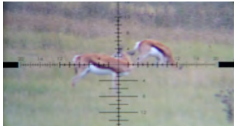
Image not in focus

[TIP: Focus your TRIGGERCAM on your preferred magnification. Ensure your parallax setting is adjusted on the correct distance. Parallax will affect focus quality.