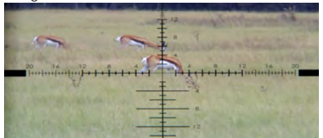
Image in focus