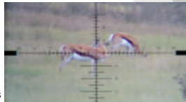
Image in focus